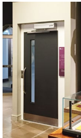
Steel door with vision panel and fire rated option