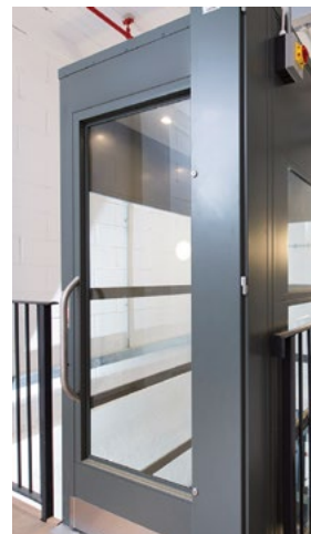
Fully glazed door