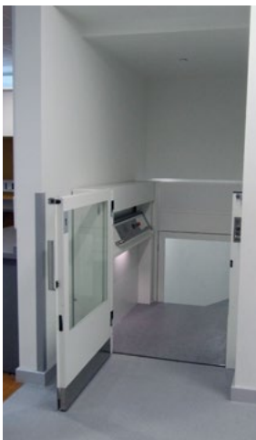
Glazed half height