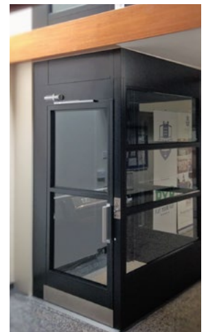
Glazed door with mid bar and fire rated option